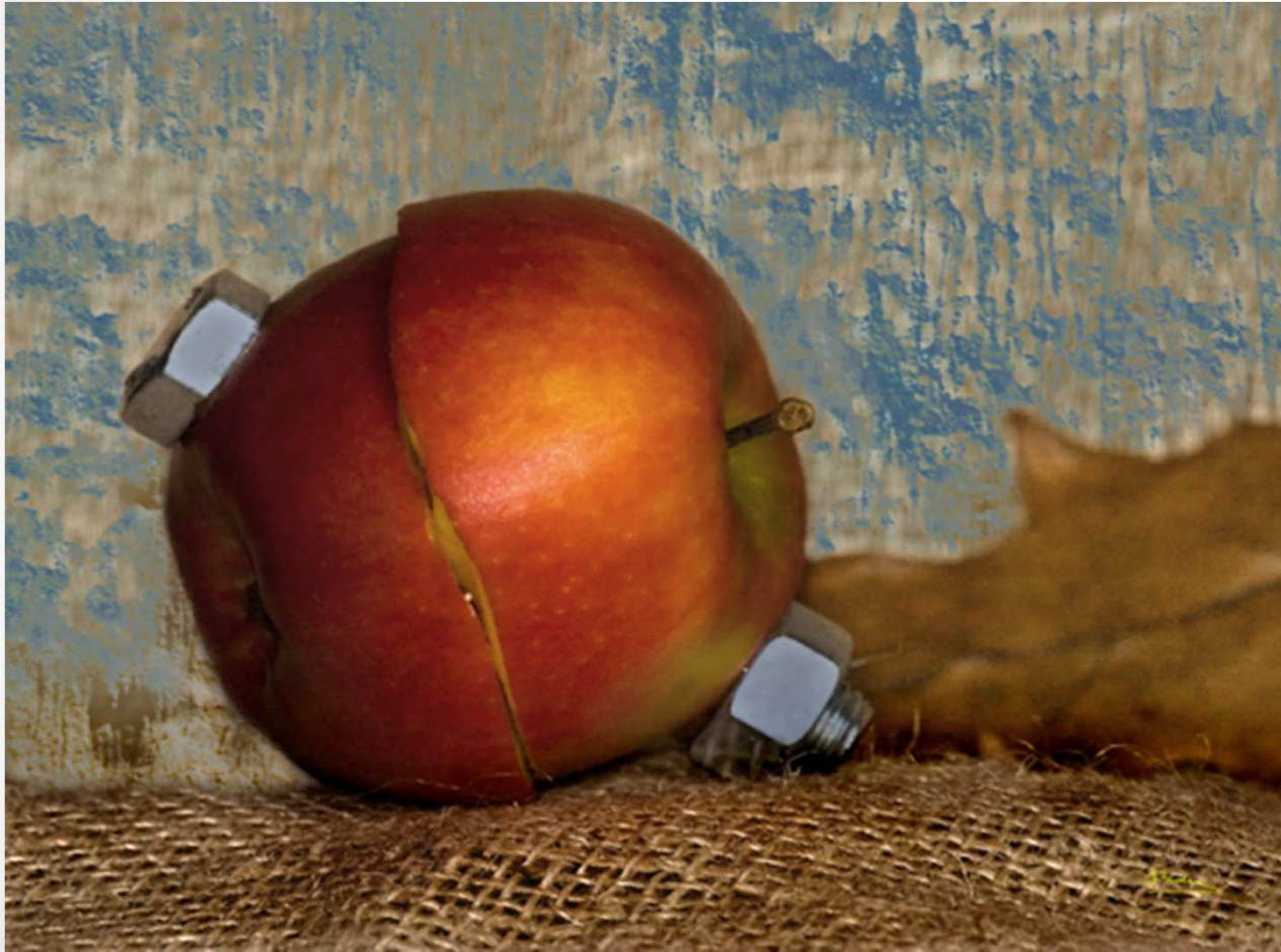
The Industrial Society, by Manuel Balea